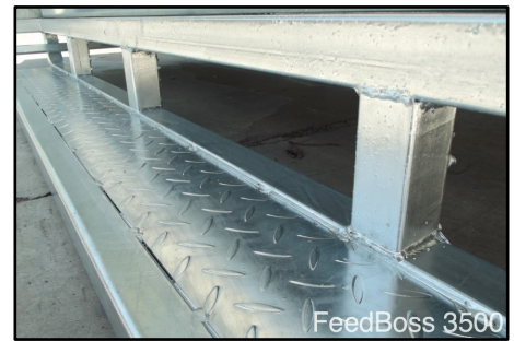
4 Skids with Checkerplate