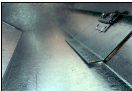
Patented* Clean-Out Trap Door